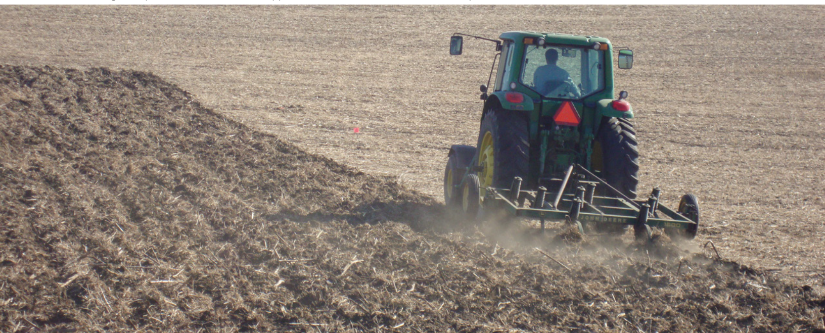
Biochar being incorporated after broadcast application to an Iowa corn field.

RESULTS: Biochar plots increased wheat yields, soil moisture levels, and fungal community abundance relative to both the no amendment control and lime treatments in 2013. Soil pH increased by a similar amount for both amendments. In 2014, both amendments increased wheat yields relative to the no amendment control. Overall, biochar increased yields by 280% (lime by 200%) over both years. 16