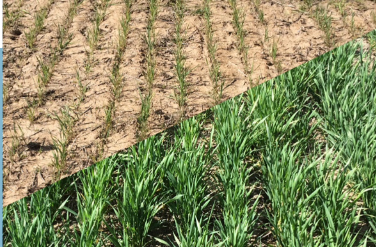
The growth of wheat in Eastern Washington in soils amended with biochar vs. unamended soils.

In 2013, the USDA-ARS established trials at the Gady Farm to compare the impacts of the seed cleaned