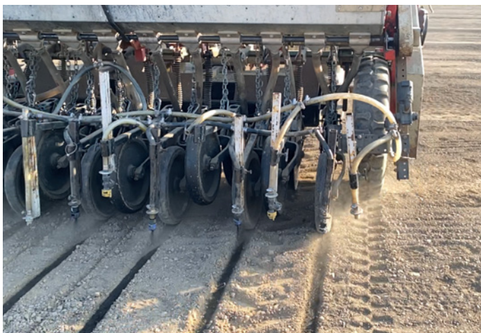
Biochar slurry application using a sprayer.

Micronized biochars can be suspended in water and injected into the root zone of perennial crops or fertigated, which could provide a slow but steady method of adding biochar to the root zone via irrigation water.