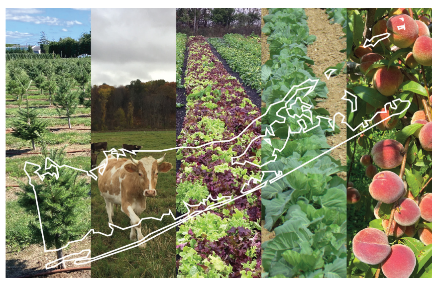
Fig. 1. The five cropping systems analyzed in Suffolk County (n=304): woody plant nurseries, pasture and hay land, mixed vegetable, process vegetable, perennial fruit

Suffolk County, the eastern two-thirds of LI, is home to over 550 farms and a tremendous diversity of agricultural operations that are integral to the region's identity and economy (Figure 1). Land values are higher and markets more focused on high-value specialty crops compared to the rest of NYS, while the climate is warmer, and the soils are more coarse-textured (high sand and low clay content). Despite being ideal for crop production, deep well-draining soils are more prone to nutrient and pesticide leaching, lower organic matter levels, and poor structure. Identifying and implementing practices that improve soil health is critical for protecting the environment, increasing the resiliency of farms to climate-related risks, and maintaining LI's agricultural industry.