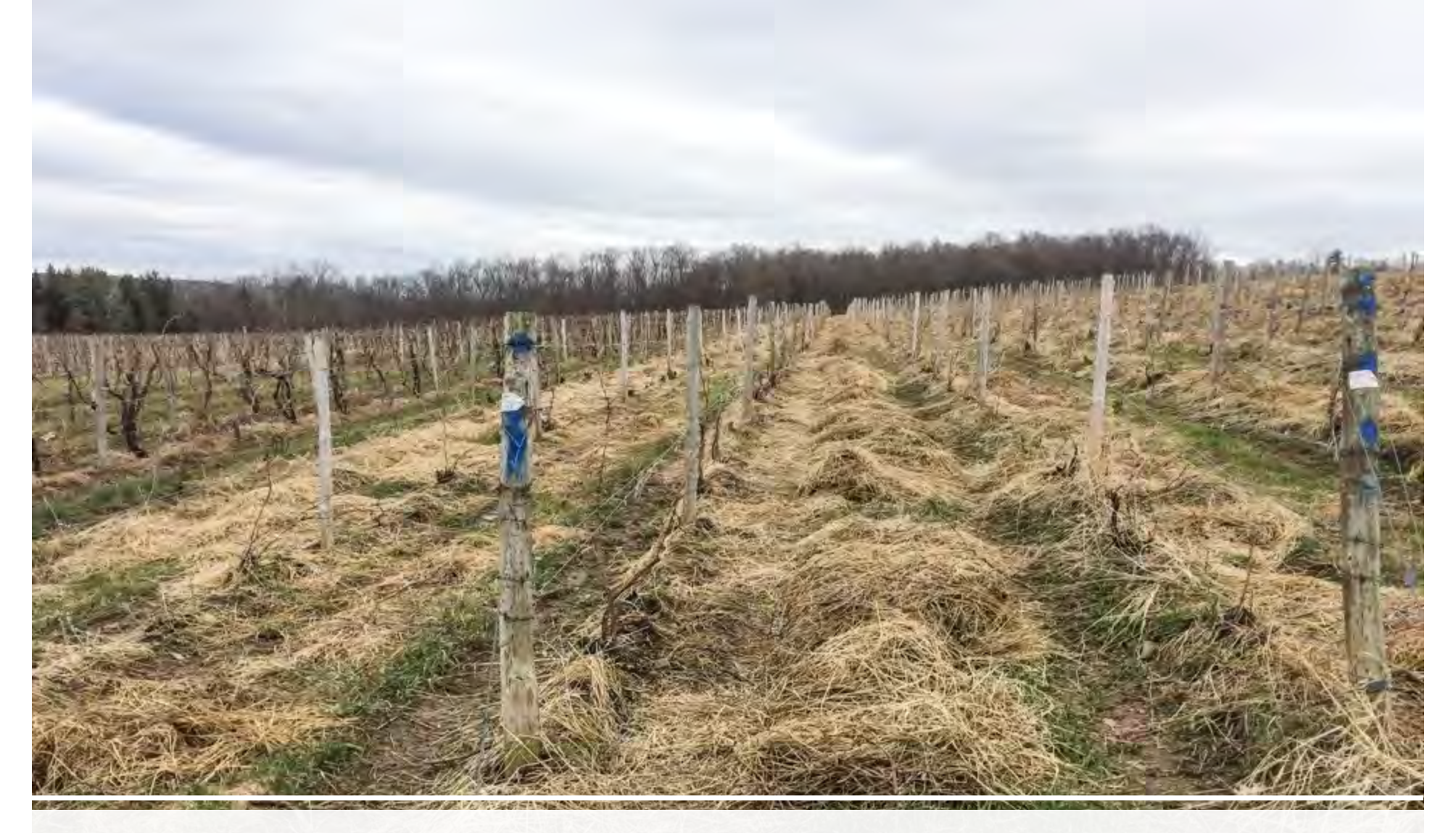
Adaptation - Polar Vortex